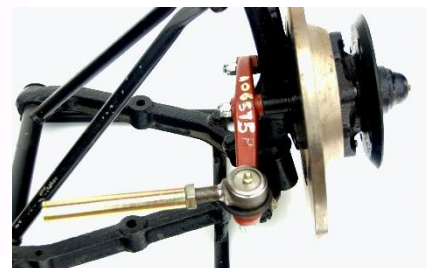
Figure 2: Original arm assembled