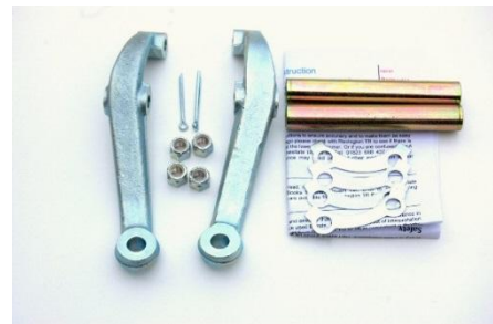
Figure 6: Kit RTR3314K contents