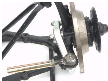
Figure 1: New arm assembled

RTR3314K:- Revington TR modified Tie Rod Lever kit suitable for original steering box arrangements.