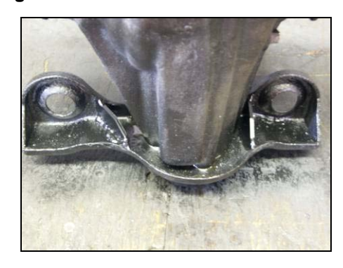
Figure 20: Item 1 Welded on the Front Mount