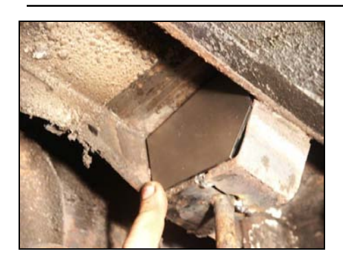
Figure 12: Item 3 Placed on the Forward Bridge Body Fitted