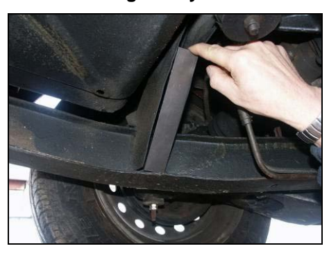
Figure 16: Item 2 Placed on the Rear Bridge Body Fitted