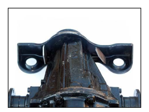
Figure 19: Item 1 Placed on Front Mount