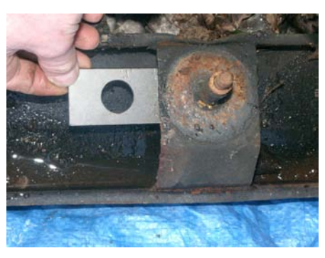
Figure 5: Item 7 Before Cutting in Half Placed Under the Forward Bridge for Use with the Body Fitted