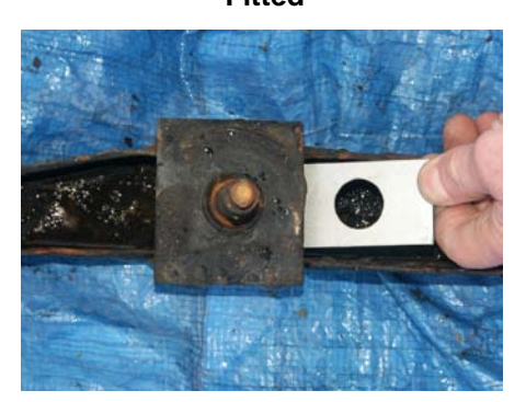
Figure 9: Item 7 Before Cutting in Half Placed Under the Rear Bridge for Use with the Body Fitted