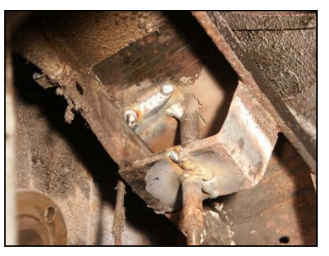
Figure 7: Half of Item 7 Welded in Place Under the Forward Bridge for Use with the Body Fitted