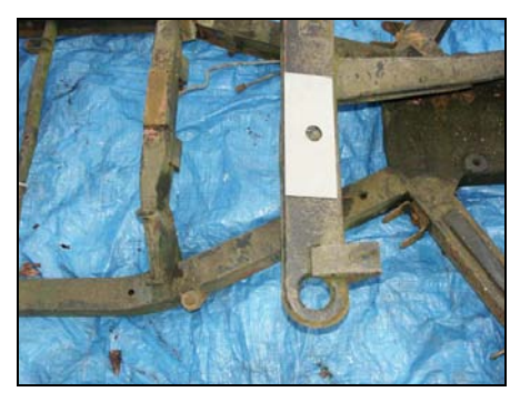
Figure 4: Item 5 Placed Above the Forward Bridge for Use with the Body Removed