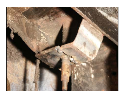
Figure 3: Typical Front Mounting Cracked in Half