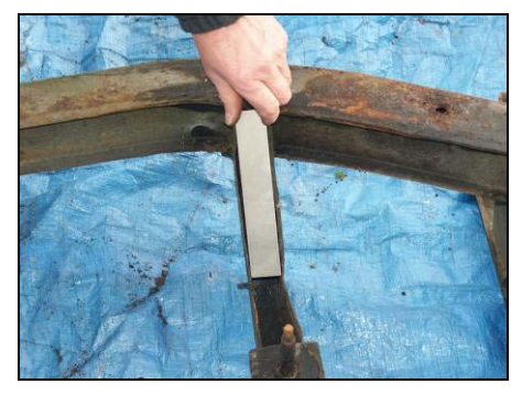
Figure 15: Item 2 Placed on the Rear Bridge Body Removed