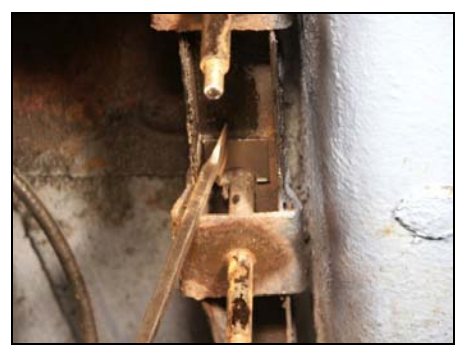
Figure 10: Half of Item 7 After Cutting Placed Under the Rear Bridge for Use with the Body Fitted