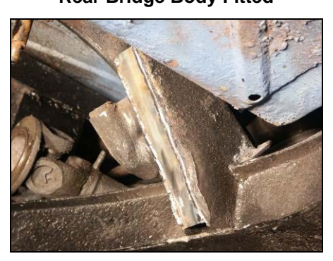
Figure 17: Item 2 Welded in Place to the Rear Bridge Body Fitted