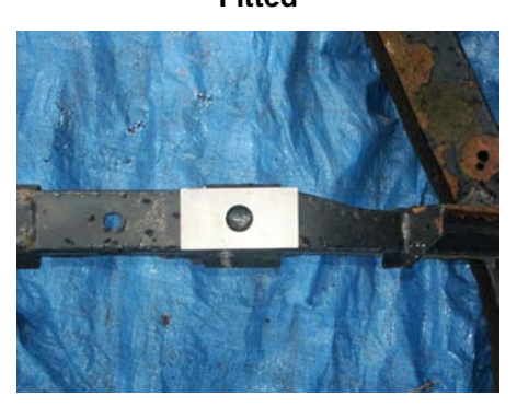
Figure 8: Item 6 Placed Above the Rear Bridge for Use with the Body Removed