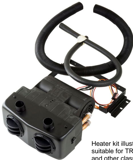
Heater kit illustrated suitable for TR2-3B and other classic Cars